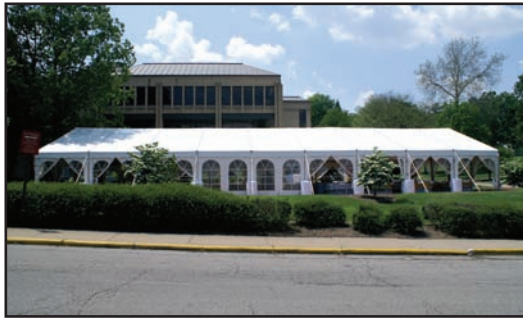
College of Wooster Alumni Weekend

Here is a sampling of the organizations that have turned to Canton Chair Rental for their equipment and expertise in the past few months.