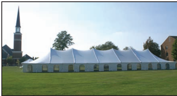
Mt. Union College "M" Club Picnic